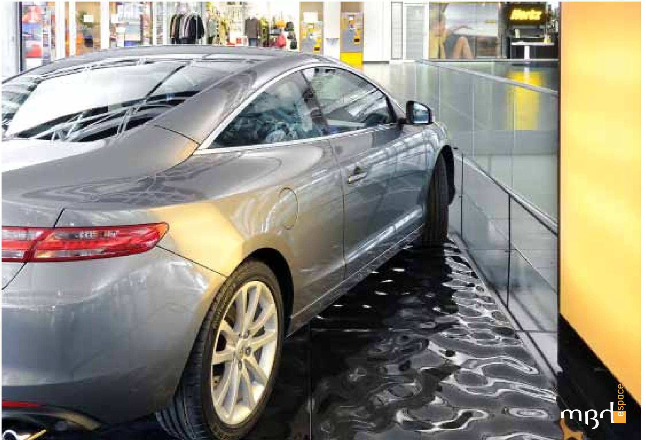
- Deployment : Design Charters